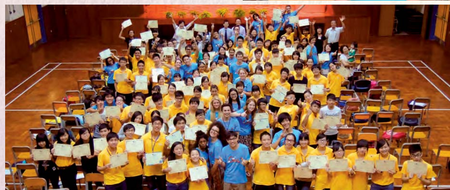
▲ Congratulations to the participants for completing the Oxbridge University Preparation Camp