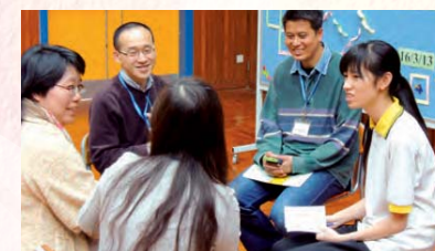
▲家長、老師和同學一起探討高中的課程