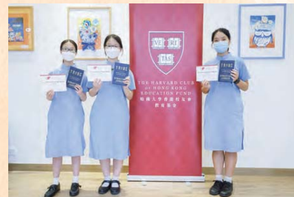
▲ Harvard Book Prize Award Runners-up