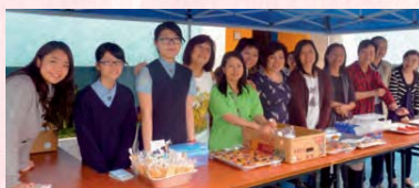
▲家長義工製作美味甜品為校慶義賣籌款。