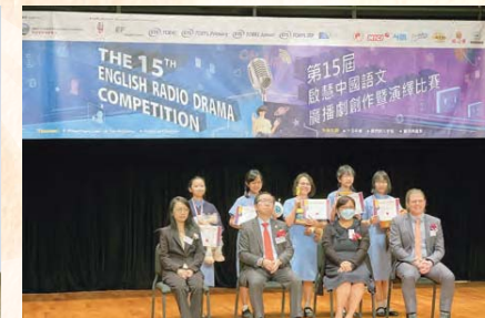
▲ Radio Drama Competition Gold Award both our Junior