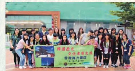
▲韓國歷史文化考察之旅