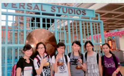
▲跨校跨地電子學習交流 - 新加坡之旅