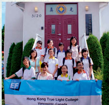
▲True Light Joint-school Summer Programme to Vancouver, Canada

本校重視教師的培訓工作，每年透過退修會、工作坊、專題講座等活動加強教師的專業發展，學校更增撥資源聘請額外約20名老師，包括外籍英語老師、各科老師、宗教主任、英文科顧問及駐校社工等，為學生提供優質教育。除課堂教學外，我們更為學生提供不同的學習經歷。除了暑期海外遊學團外，各科分別組織不同地區的交流團，包括：英國、澳洲、加拿大、新加坡、台灣、北京、上海、四川、清遠、順德、廣州及澳門等地，並因應各級學生的不同需要舉辦歷奇體驗營，藉著課堂內外學習的結合，提升學與教效能。