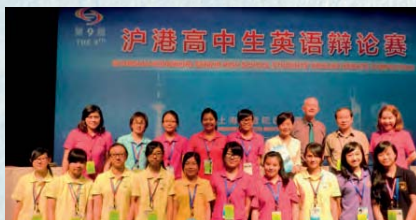
▲Participating in the Hong Kong & Shanghai Debating Competition

本校重視教師的培訓工作，每年透過退修會、工作坊、專題講座等活動加強教師的專業發展，學校更增撥資源聘請額外約20名老師，包括外籍英語老師、各科老師、宗教主任、英文科顧問及駐校社工等，為學生提供優質教育。除課堂教學外，我們更為學生提供不同的學習經歷。除了暑期海外遊學團外，各科分別組織不同地區的交流團，包括：英國、澳洲、加拿大、新加坡、台灣、北京、上海、四川、清遠、順德、廣州及澳門等地，並因應各級學生的不同需要舉辦歷奇體驗營，藉著課堂內外學習的結合，提升學與教效能。