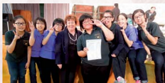
▲ Posing with the adjudicator after completing English Drama Improvisation Competition