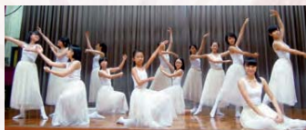
▲ Dancing for Thematic Group Speaking in Speech Festival