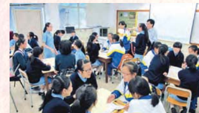
▲穗港真光學生學習交流

In order to help parents understand our school better and to facilitate communication between parents and our school, the Parent Teacher Association provides a variety of activities for parents, students and the school to keep in touch and these foster a spirit of cooperation between parents and school. The PTA has developed a network for parents to befriend each other through phone calls and activities as well as during lunch delivery time. Volunteer parents also help organize activities like picnics, parents tea-gathering, school anniversary charity bazaars and even go on duty in the school's Parent Resource Centre. In recent years, as different education reforms came into effect, the PTA has been playing an active role in hosting a variety of workshops and seminars, like "How parents can help their children to learn English" and "Knowing about SBA". All these activities enable the school to keep parents abreast of the latest developments in curriculum reforms. Meanwhile, in the area of assisting with the school's Other Learning Experiences development, the PTA has also made a significant contribution via subsidizing students' activities such as cross border academic exchanges and other activities.