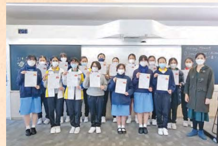
▲ Canadian English Writing Competition Silver Awards, Bronze Awards, Runner-up