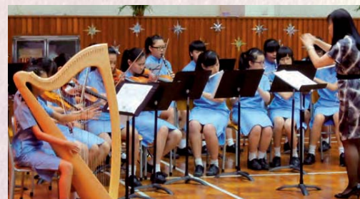
▲小小音樂家 - 我們的管樂團。