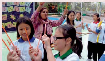
▲ Celebrating Indian festival - Diwali on English Monday