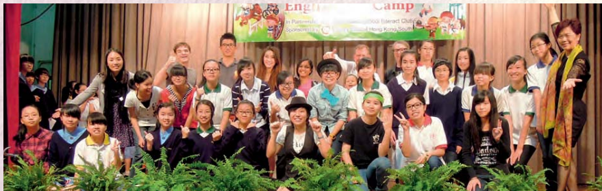
▲ Reading, understanding and learning from Shakespearean plays in the English Day Camp