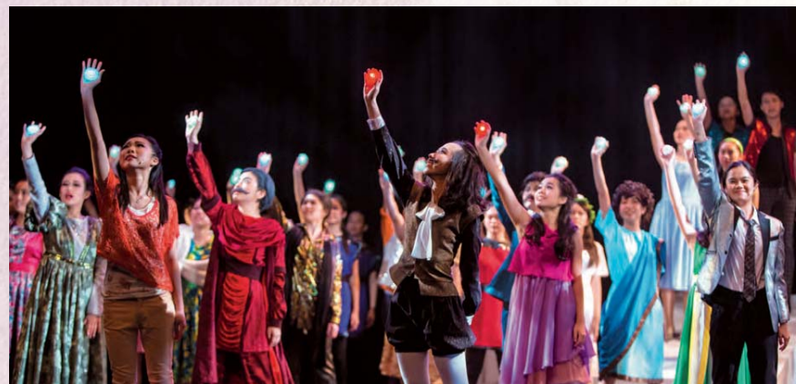
▲校慶音樂劇 - 在台上發光發亮。