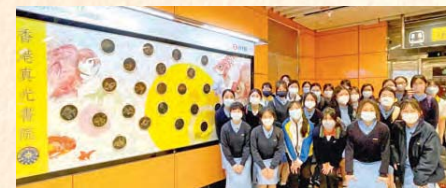
▲ 用彩筆，美化我的社區，畫出我心中未來的。

True Light girls have always put up outstanding performances in external activities. In the past three years, we have received approximately 900 different awards of which 90 of them were awarded championship, 1st runner-up and 2nd runner-up in various competitions and 150 of them were awarded merits. The outstanding achievements including the Award for Achieving 10,000 hours of Volunteer Service, Hong Kong Outstanding Youth Volunteers, Outstanding Students of Hong Kong Island, Outstanding members of the Community Youth Club, Red Cross Outstanding Unit of the Year Award as well as various awards in Archery, Fencing, English Improvised Drama and in the Hong Kong Drama School Festival. Moreover, seven students have participated in an international archery competition and today we hold 32 local records in Youth Archery.