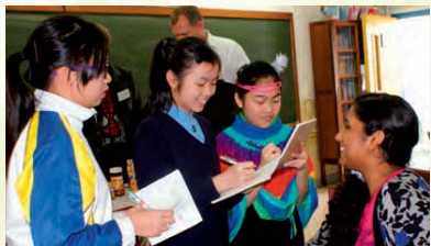
▲ Student reporters interview International School students.