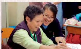
▲ 義工服務，愛心滿溢！

本校秉承真光辦學宗旨，通過正規及聯課課程，積極為學生提供多元化及廣泛的學習經歷，培養學生的德、智、體、群、美、靈六育的發展。