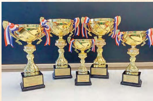
▲ During these years, our school has reaped great success in Hong Kong Secondary Schools Debating Competition with both our Junior and Senior English debating teams becoming the champions in the grand Finals for many years.