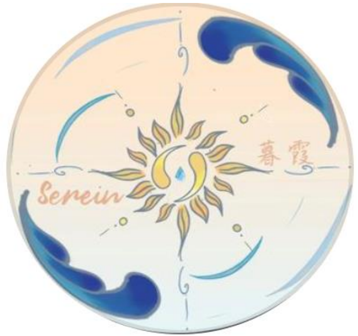
This is the logo of Serein, the 45th Student Union of Hong Kong True Light College.