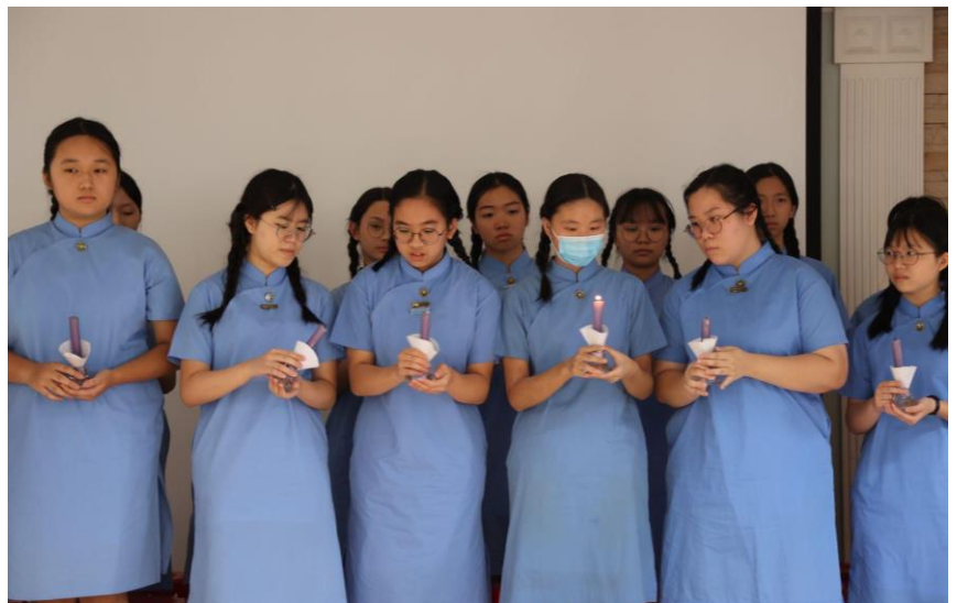
Passing the flame carefully, the members of Serein

Unlike in the past, the Student Union Inauguration Ceremony was held at True Light Hall. This gave everyone a brand new experience! After the speech given by the chairlady of the 44th Student Union, she lit the candle in her hand and passed the flame to a member of the 45th Student Union on the stage. The candle-light passing on ceremony was much more splendid and stunning as the audience sat a lot closer to the stage where the candles being lit up one after one was more clearly visible, and the solemn yet moving atmosphere was spread to the entire hall. Amazed by the ceremony, students were all invited to sing "Pass It